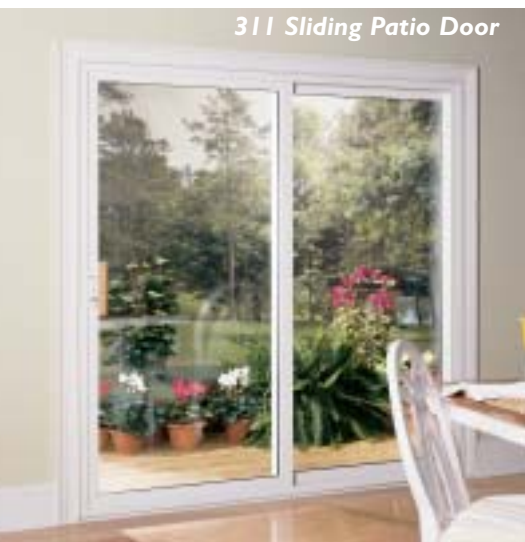
311 Sliding Patio Door

All-welded frame and panels are pre-assembled for easy installation, and an easily removable nailing fin simplifies installation. Next, the reversible panel design enables right or left door openings, while the aluminum track smoothes movement. Doors feature a 7/8" insulated Intercept sealant system