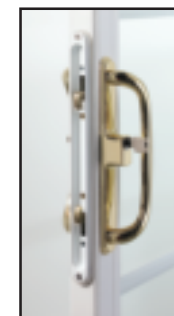
Multi-Point Lock (standard)