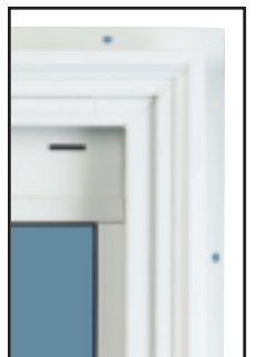
Brick Mould J-Channel (optional)