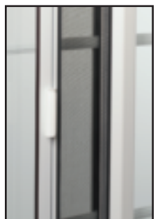
Hide-Rite Retractable Screen (optional) on 2 panel doors only