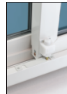
Foot Bolt Lock (optional)